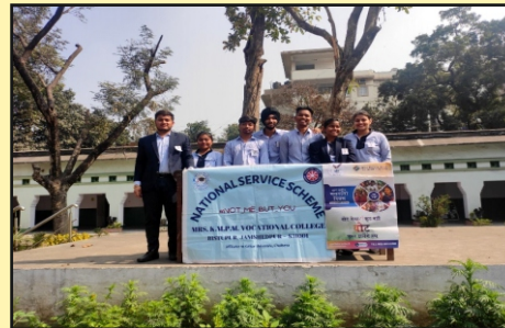
National Voters Day