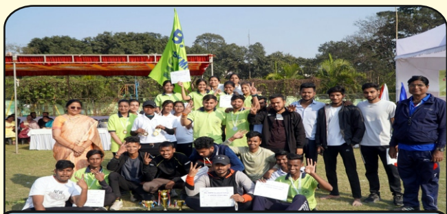
8th Annual Sports Meet (2023-24)