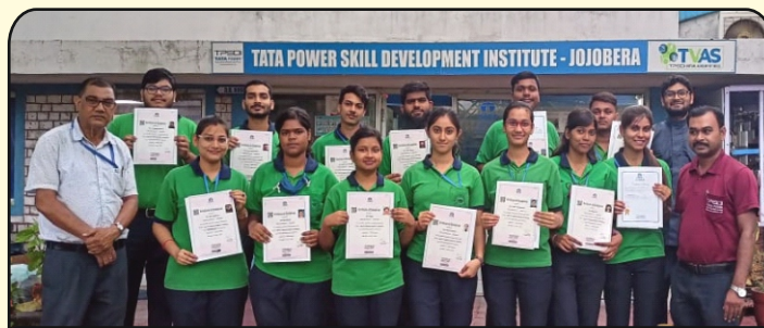
Skill Development Program (Tata Power)