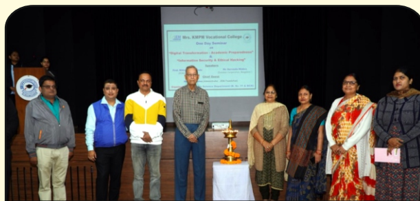
Regional Seminar on Information Security & Ethical Hacking