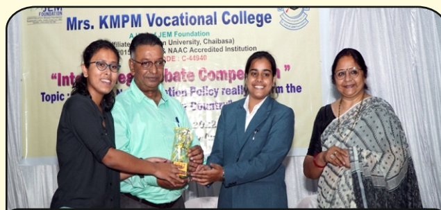
Inter College Debate Competition