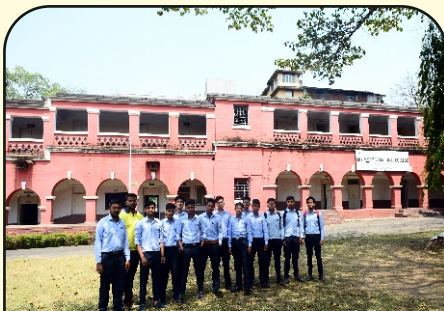
MAIN ROAD CAMPUS

On Main Road Bistupur, in the heart of the steel city, nestled in five acres of green cover, the college is a landmark with its period red brick buildings. The college has technology enabled spacious classrooms. A state of art computer lab with TFT machines and high capacity server have been set up to provide the best practical training facility for the students. The college offers library facilities both within the premises and outside to ensure students have access to vast reference pool. All Students get an access to "NATIONAL DIGITAL LIBRARY" (NDL) for their projects & assignments. In addition the college has adequate games and recreation facilities to ensure that students have outlets for both their physical and creative energies..