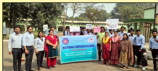
Voting Awareness Rally