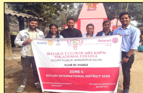
Food Donation Drive