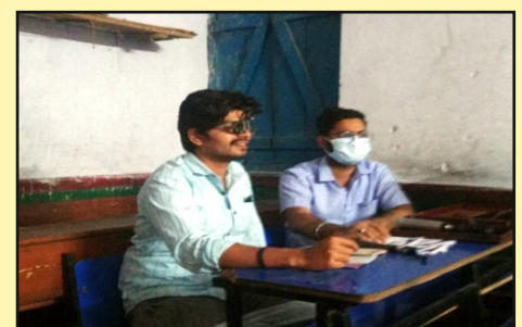
Eye Checkup Camp