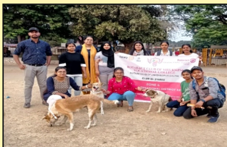
Radium Belt for Street Dogs