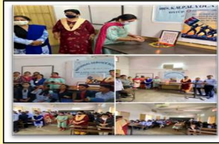
Tribute to martyred Soldiers