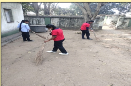
Clean Campus Drive