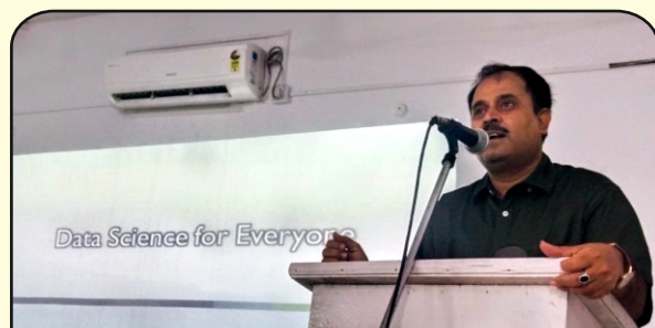
Seminar on Data Science for Everyone