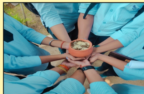
Meri Maati Mera Desh