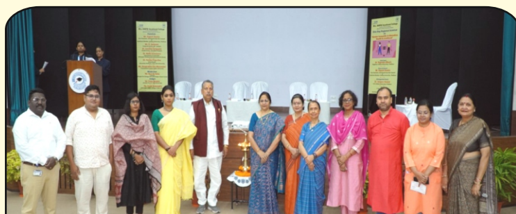
Seminar on Gender Inequality in Education, Health & Livelihood