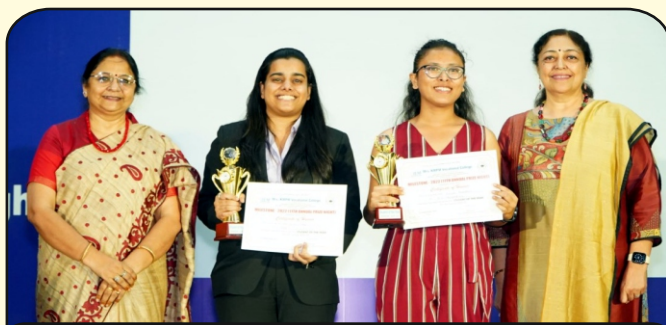
Milestone 2022 (11th Annual Prize Night)