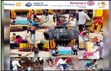
Distribution of Slippers (Rebuild Camp)

The Rotaract club of our college has always been very active in organising a number of events to help poor & needy people of the society.