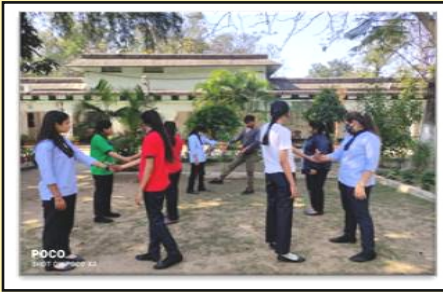
Self Defence Training

The NSS unit organise many online & offline activities to inculcate leadership skills amongst students.