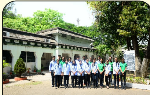
J - ROAD CAMPUS