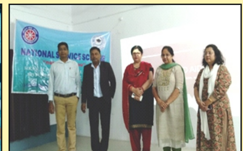
World AIDS Day