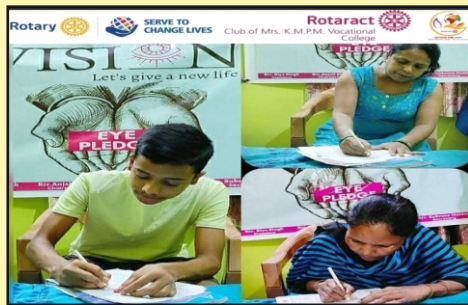
Eye Donation Pledge Drive