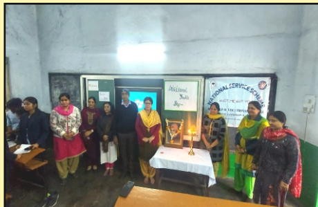
National Youth Day