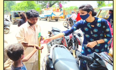
Care Kit Project